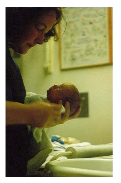
This baby is showing signs of needing some time out. \rightarrow

← The frown, tightly held fists and tension in the lower face show this baby is worried but not (yet) distressed.