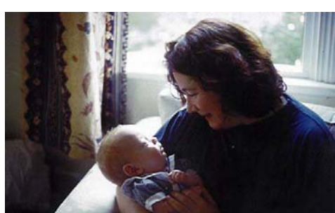
A quiet, alert baby, interested in his mother's face and voice. He almost appears to be mimicking her facial expression

← This baby is calm and alert, holding his mother's gaze. Perhaps he is feeling secure because of the swaddling.